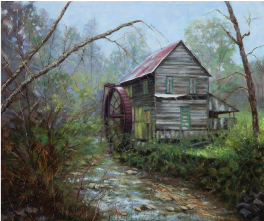
Top Left: Boy fishing , 11x14", oil Top Right: Peggy's Cove , 22x28", oil Bottom: Healan's-Heads Mill 20x24", oil